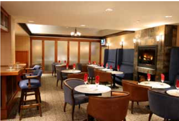
The Chelsea Lounge Seating