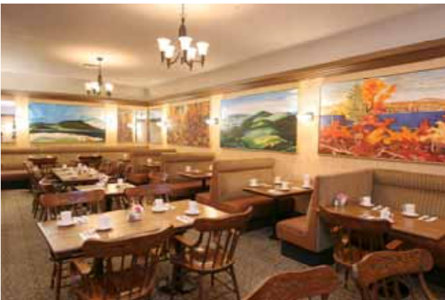
The Chelsea Restaurant Seating