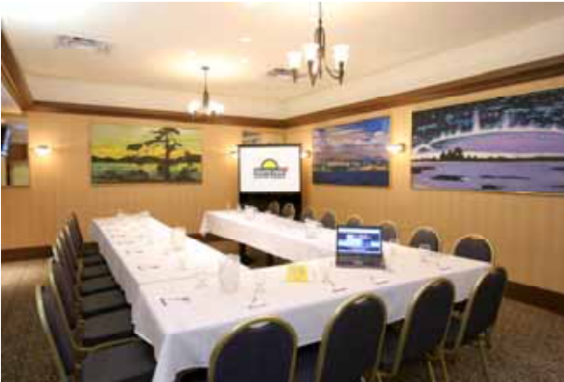
The Abbey Room: U Shape Seating