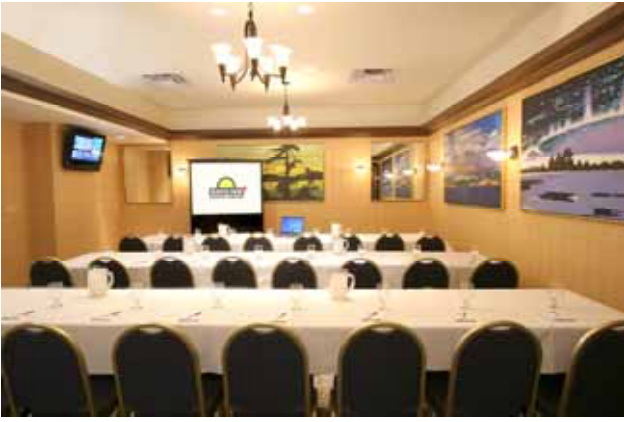
The Abbey Room: Theater Seating 40